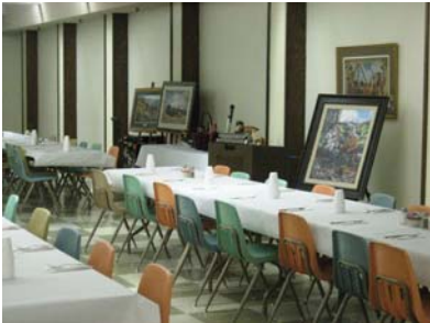
Some of the Live Auction Items