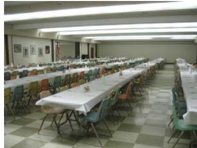
Tables set for about 300 people.