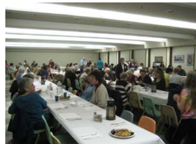
Part of the about 600 people served with 580 tickets sold. Children under six were free. Wonderful Attendance